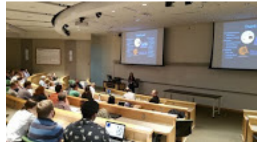
Attendees at the southeast regional meeting