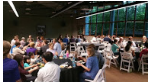
Participants enjoyed dinner at Zoo Atlanta

The 2015 Southeast Regional DVM/DCB SICB meeting was held the weekend of October 10th at Georgia Tech. Over 80 attendees from labs across the southeast attended a total of 40 talks covering topics ranging from remora adhesion to hawkmoth flight control to beetle respiration, followed by an after-hours tour of Zoo Atlanta's newly renovated reptile exhibit and dinner in the zoo's grand hall.