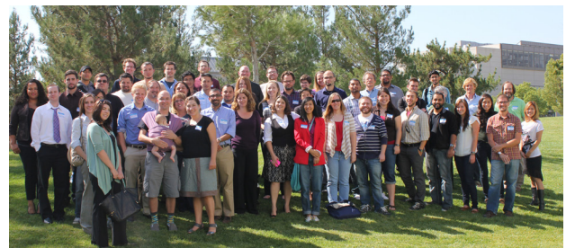
Participants at the inaugural and enormously successful DVM/DCB Southwest Regional Meeting.

Have a terrific Fall quarter or semester and see you in San Francisco in 2013!