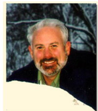
Our Program Officer

To better prepare for elections next spring, I would like you to think about whether or not you might be interested in and willing to either serve on a nominating committee for candidates for these positions or if you might want to run for Chair or Program Officer. We will start recruiting for both the nominating